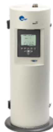
Model 125 10 L/min 13 Stage MOUDI-II