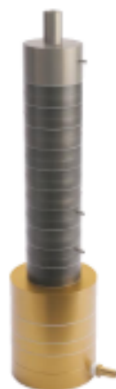
Model 122 30 L/min 13 Stage MOUDI-II

Second generation, Micro-Orifice Uniform-Deposit Impactor (MOUDI-II™ Impactor), with internal stepper-motor stage rotation to provide uniform particle deposit on collection substrates, for precision, high accuracy, wide-range aerosol sampling from 10 nm to 10,000 nm with 13 impaction stages